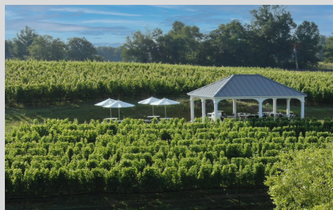
The Vineyard Pavilion