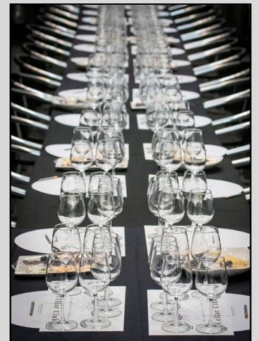
The table is set in Boxwood's Chai