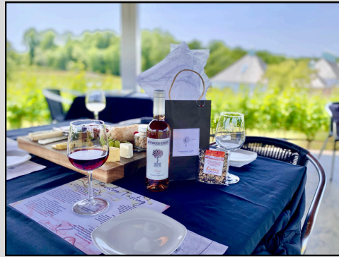
Make it a Celebration with a Gift Bag: a Half Bottle, Wine Charm, Logo Glass and Chocolate Bar