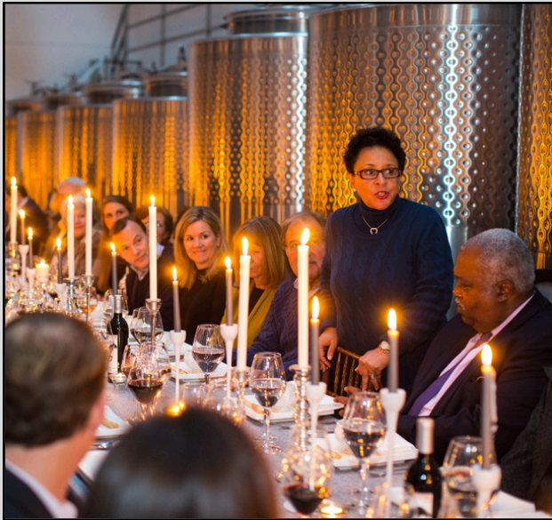
Boxwood's Chai, set for an elegant Middleburg Film Festival dinner.