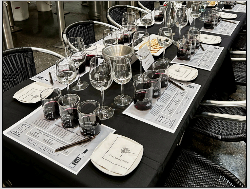
A barrel tasting, with Boxwood's winemaker, is available in The Executive and Middleburg VIP packages. Our Chai, at right, is an authentic wine-making space that is perfect for tastings and events.