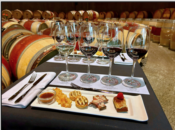
The Estate Pairing is a Cellar Experience in Boxwood's Cave.