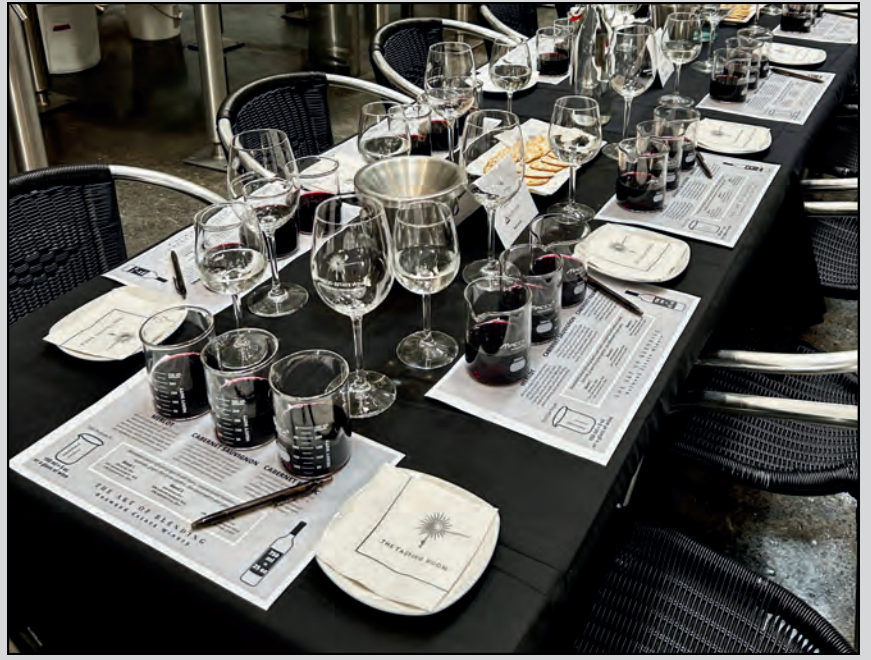
A barrel tasting, with Boxwood's winemaker, is available in The Executive and Middleburg VIP packages. Our Chai, at right, is an authentic wine-making space that is perfect for tastings and events.