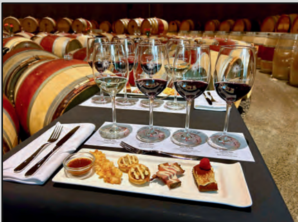
The Estate Pairing is a Cellar Experience in Boxwood's Cave.