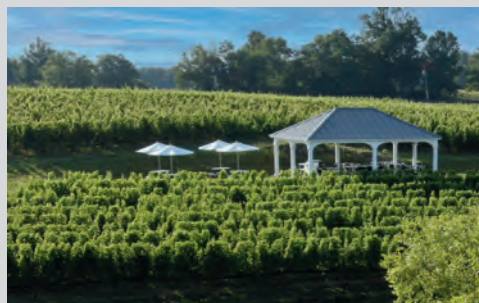
The Vineyard Pavilion