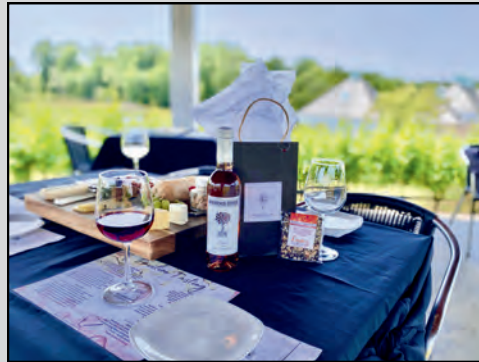
Make it a Celebration with a Gift Bag: a Half Bottle, Wine Charm, Logo Glass and Chocolate Bar