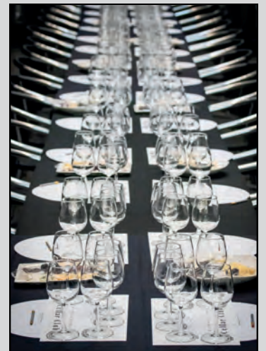
The table is set in Boxwood's Chai