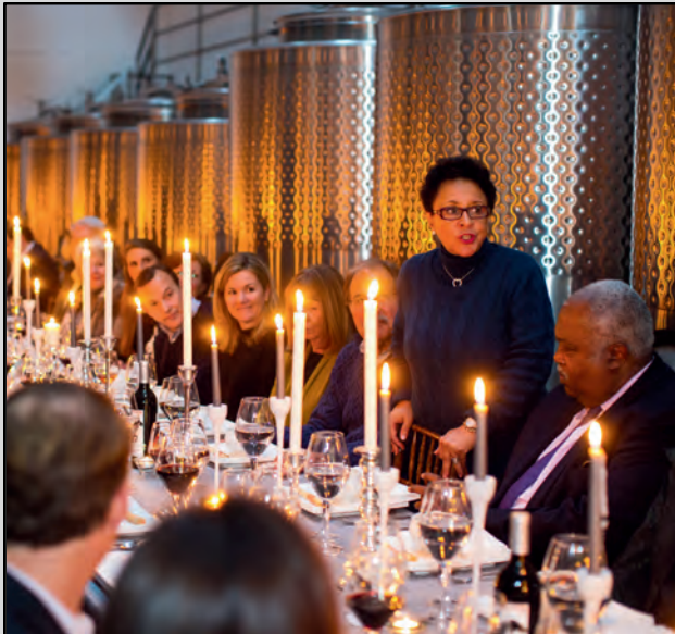
Boxwood's Chai, set for an elegant Middleburg Film Festival dinner.